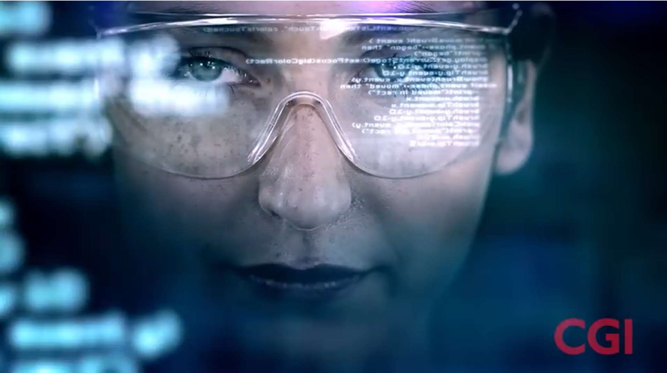
That's CGI. - YouTube