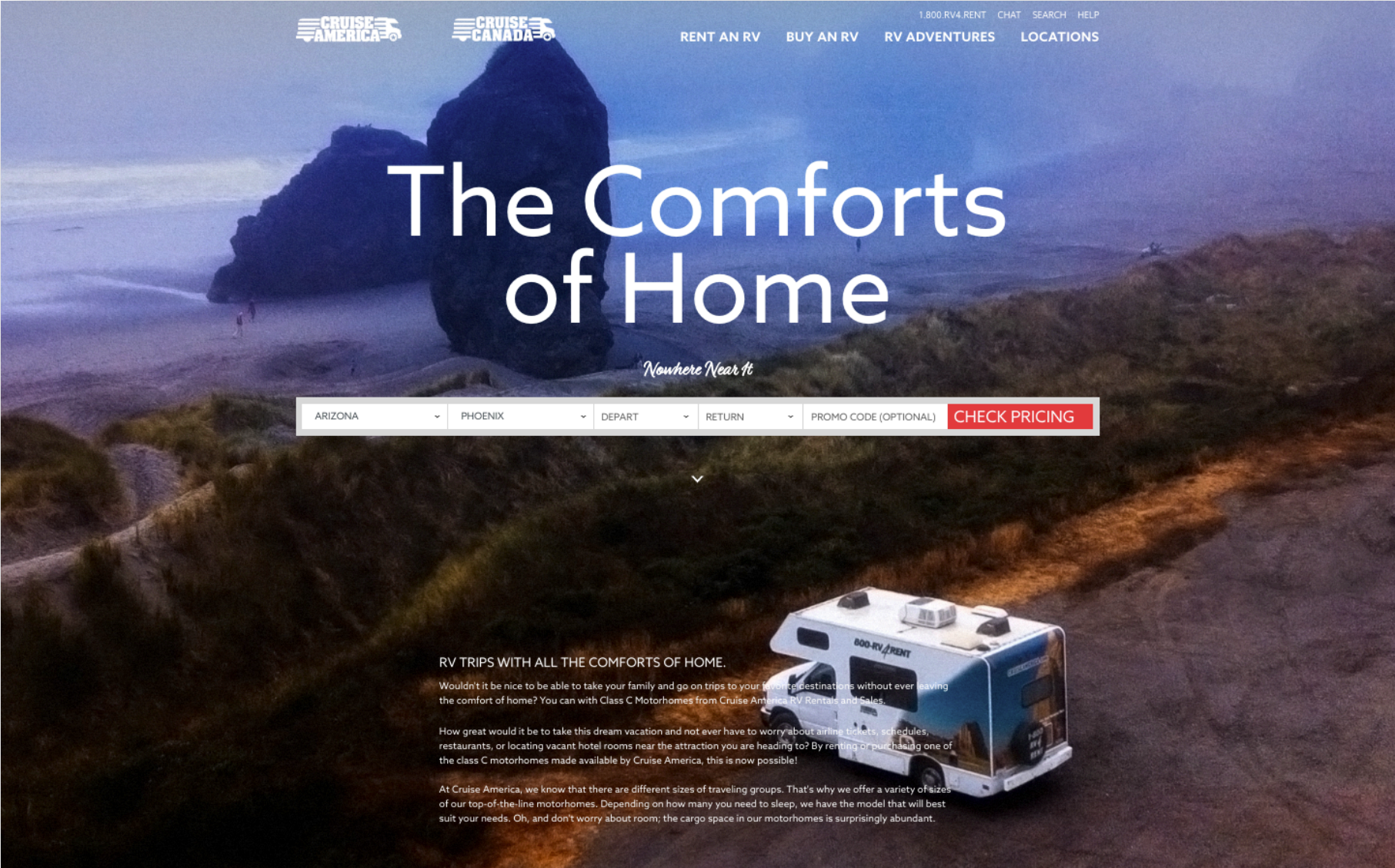
CRUISE AMERICA: BRAND STRATEGY, MESSAGING PLATFORM, DIGITAL DEVELOPMENT