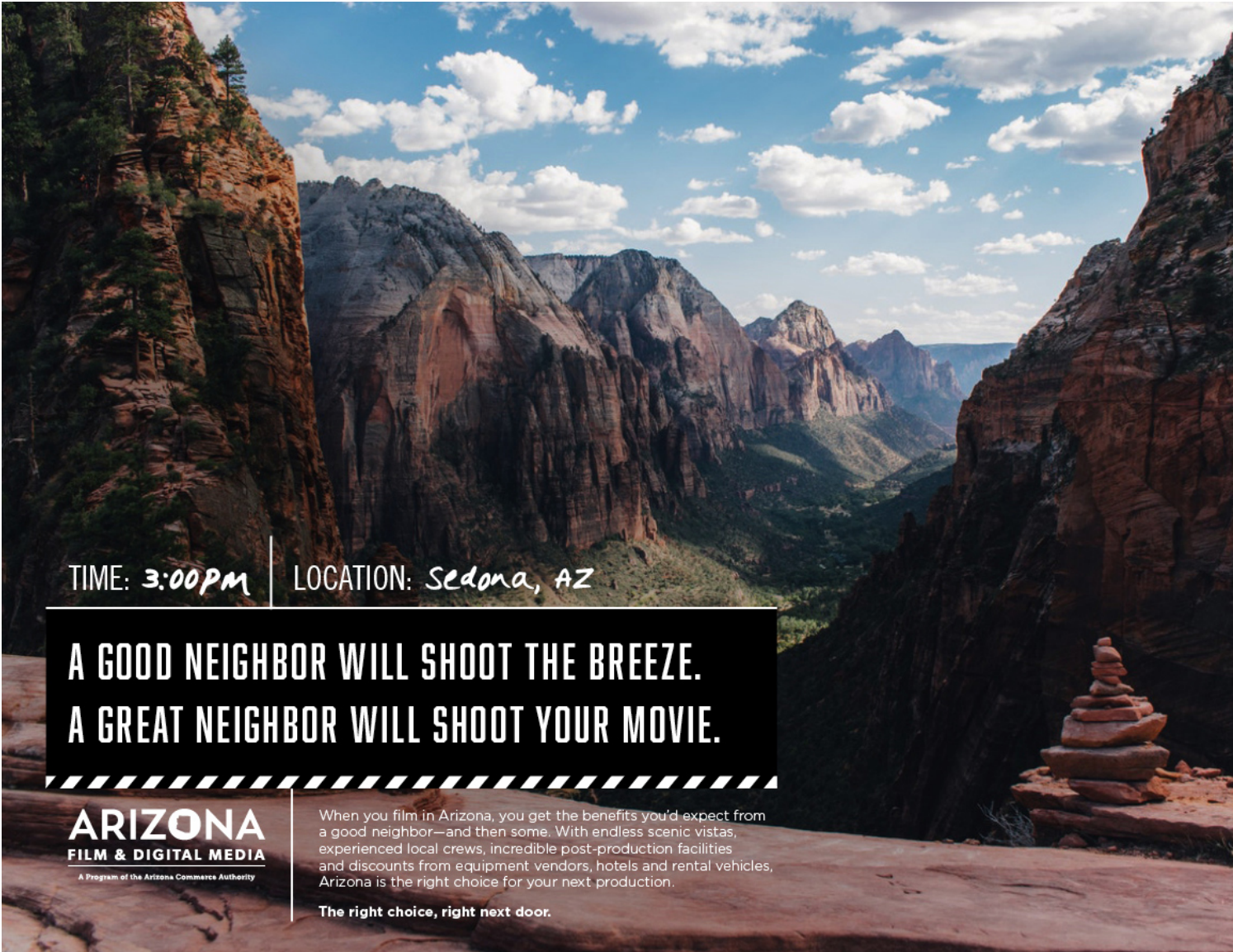
AZ FILM & DIGITAL MEDIA OFFICE: CAMPAIGN STRATEGY, MESSAGING PLATFORM, TAGLINE