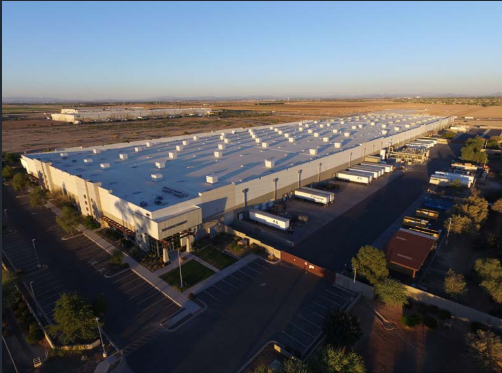
Phase I - 465,000 square feet