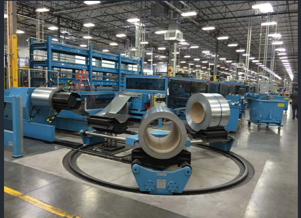
Phase 2 - 262,000 square feet