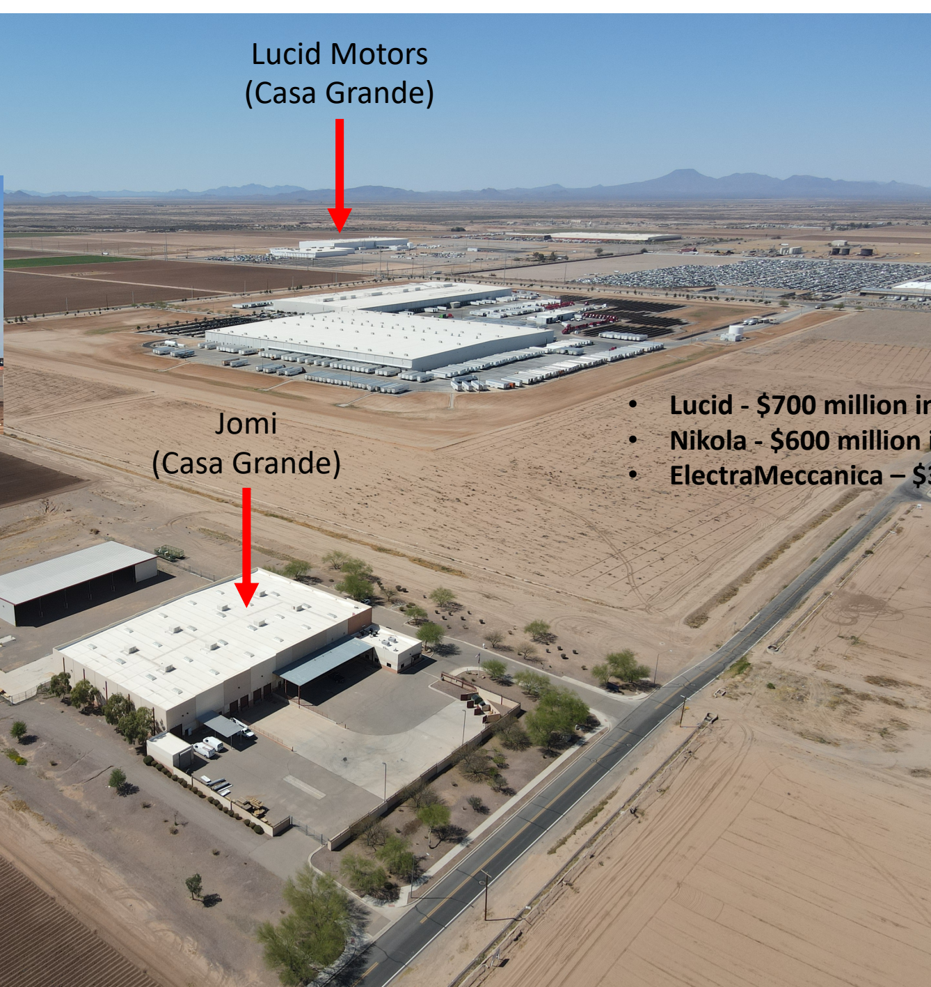
Lucid Motors (Casa Grande)